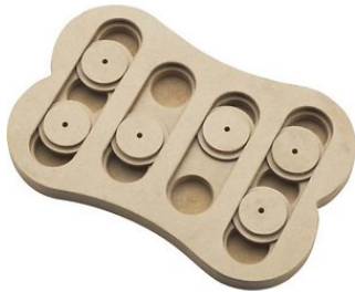
Ethical Pet Seek-A-Treat Shuffle Bone Puzzle Dog Toy