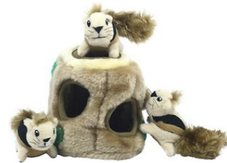
Outward Hound Hide A Squirrel Puzzle Dog Toy, Large