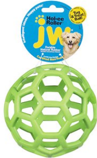
JW Pet Hol-ee Roller Dog Toy, Large